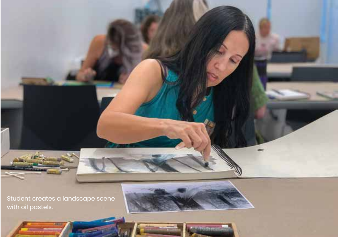
Student creates a landscape scene with oil pastels.