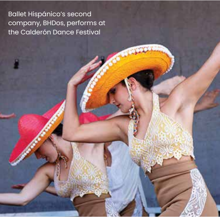
Ballet Hispánico's second company, BHDos, performs at the Calderón Dance Festival