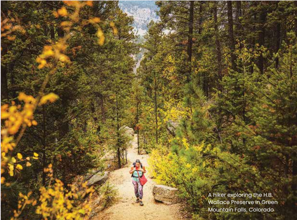
A hiker exploring the H.B. Wallace Preserve in Green Mountain Falls, Colorado