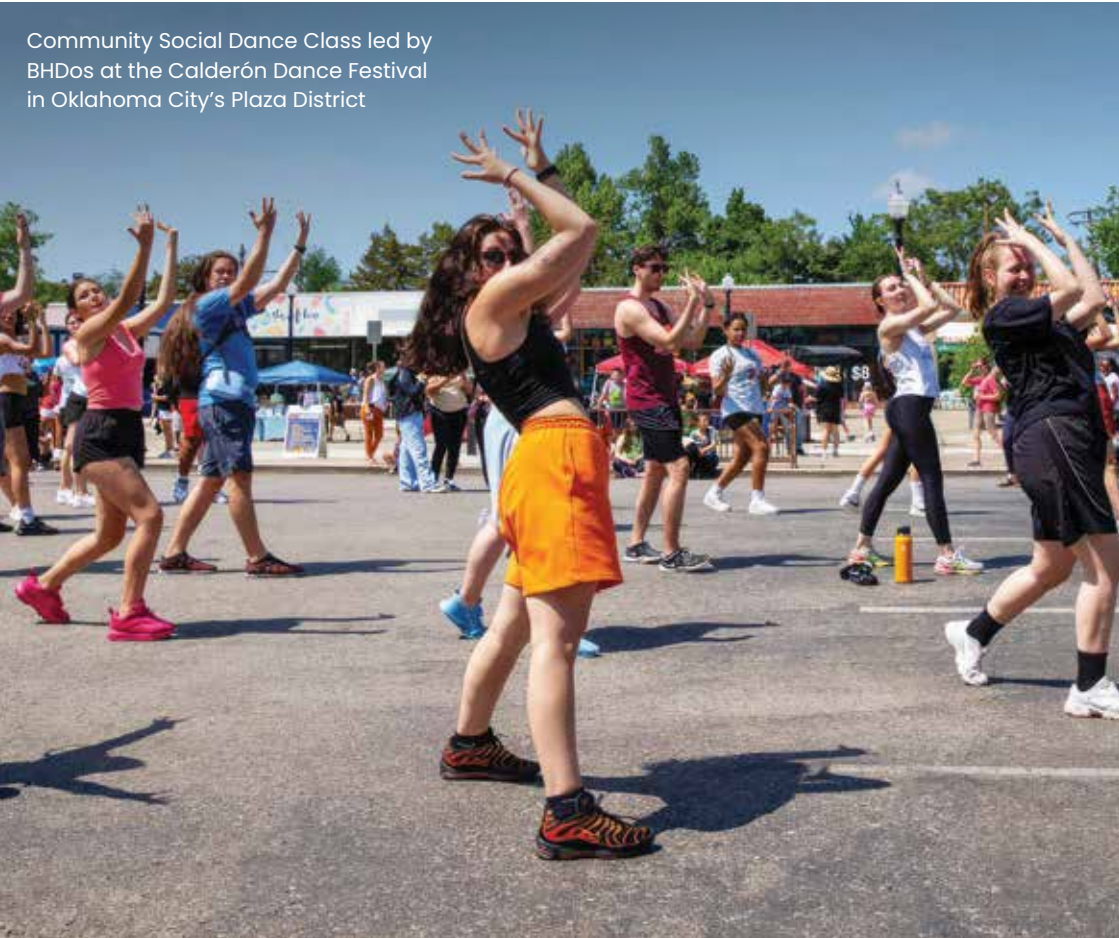
Community Social Dance Class led by BHDos at the Calderón Dance Festival in Oklahoma City's Plaza District