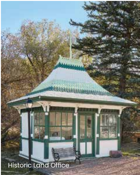
Historic Land Office