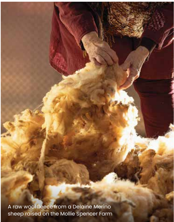
A raw wool fleece from a Delaine Merino sheep raised on the Mollie Spencer Farm