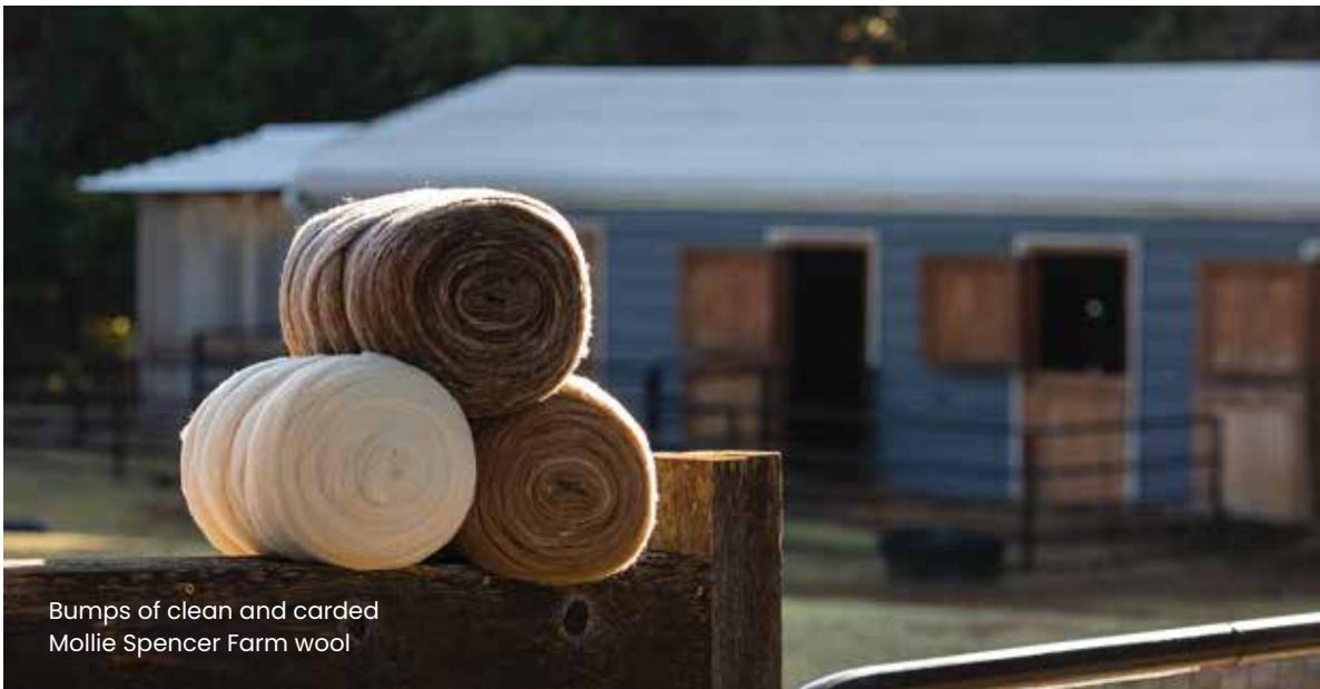
Bumps of clean and carded Mollie Spencer Farm wool