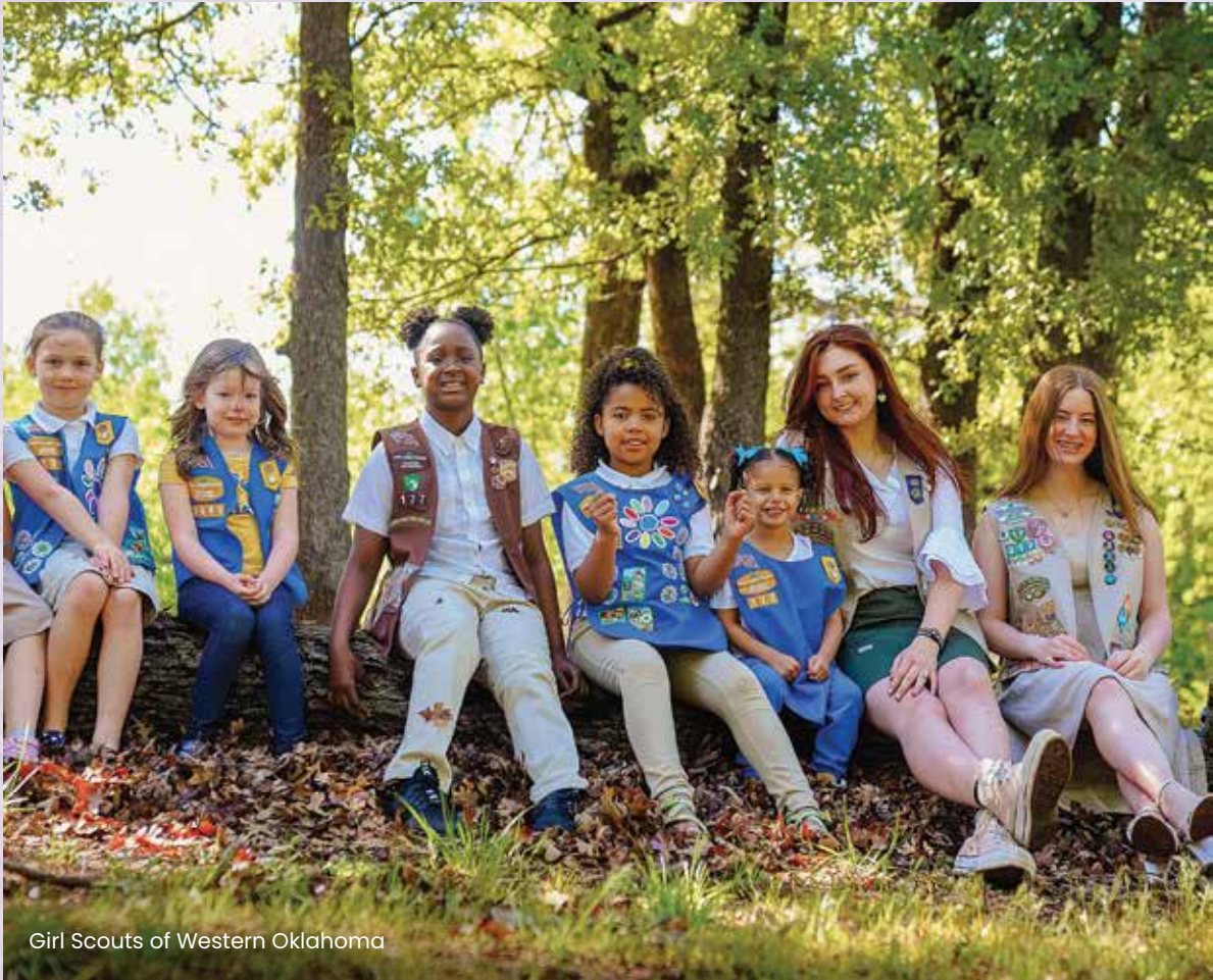
Girl Scouts of Western Oklahoma

Ashley Altshuler Memorial Fund Bishop McGuinness High School Carl Albert Center Casady School Community Literacy Centers Cristo Rey Oklahoma City El Reno Public School Foundation Friends of the Norman Public Library Kent School Fund Kingfisher Educational Foundation L'Alliance Francaise d'Oklahoma Langston University Development Library Endowment Trust Madeira School McLoud School Foundation Menlo College Mount St. Mary Catholic High School Northeastern Illinois University Oklahoma City University Meinders School of Business Oklahoma School of Science and Mathematics Oklahoma State Regents for Higher Education Payne Education Center St. David's School Thick Descriptions U.S. Air Force Academy - John E. Kirkpatrick Fund U.S. Military Academy - John E. Kirkpatrick Fund