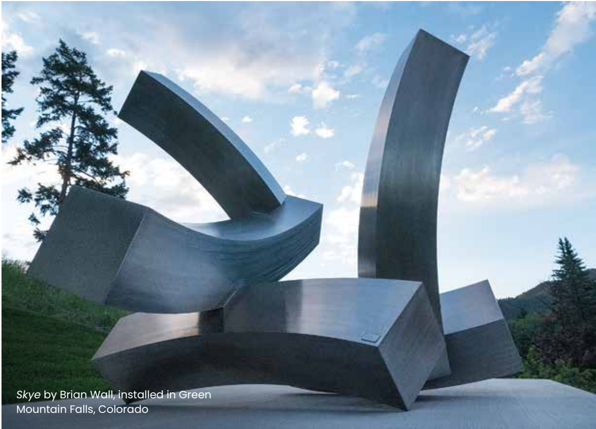
Skye by Brian Wall, installed in Green Mountain Falls, Colorado

Communication X9 was installed at Mountain Road Corner in 2022. In 2023, the Museum Exchange facilitated the donation of Skye , a series of geometric elements constructed of welded stainless steel by British-born American sculptor Brian Wall, which is on view at the Lakeview Terrace. Permanent and temporary sculptures can be explored throughout Green Mountain Falls and audio tours are available at greenboxarts.org . The Green Box 2022–2023 Annual Report accompanies this report and provides comprehensive information related to the year-round slate of programs and its annual Green Box Arts Festival.