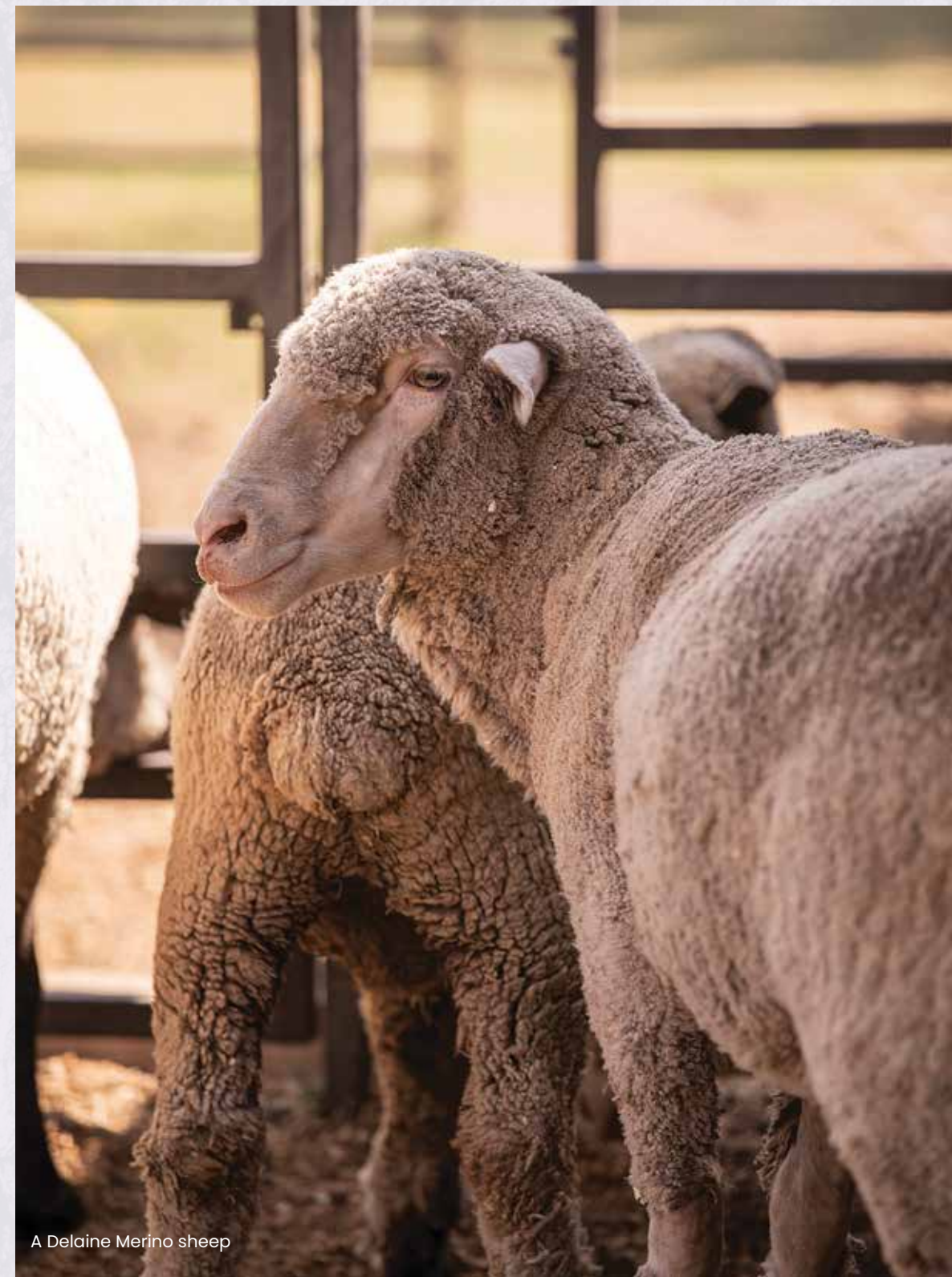
A Delaine Merino sheep