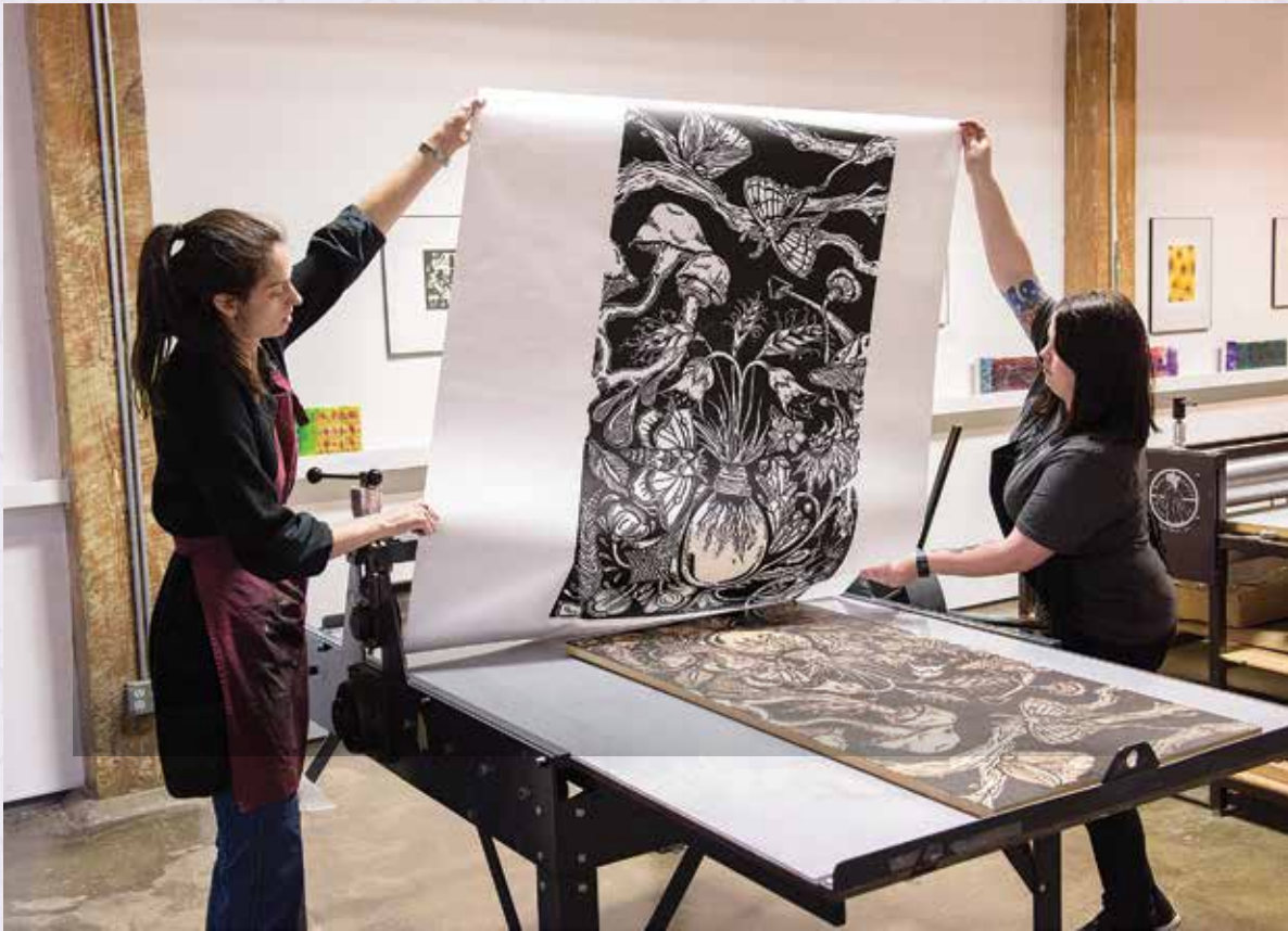
Artists lift a wood relief print off the press at Artspace at Untitled.

Family Archive websites. The archive website was updated in 2022 and 2023, providing easier access to visitors interested in genealogy and exploring in greater detail the contributions of the Kirkpatrick family and their pre-statehood presence in Oklahoma. The archive contains more than 43,000 items, with information added continuously. Visit the archive at kirkpatrickfamilyarchive.com . The Kirkpatrick family spent a good deal of time and derived great pleasure from the outdoors. The photos on this page represent multi-generational examples of this family interest.